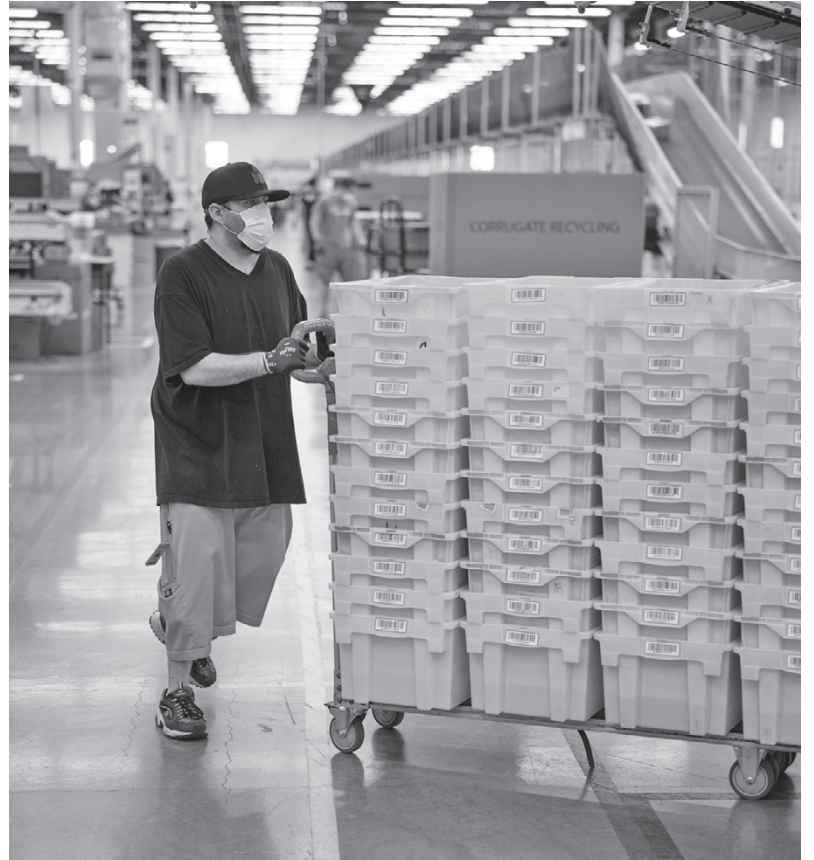
Amazon is looking to build a shipping and warehouse facility in the Town of Niagara.

"These transformative economic development awards to Amazon, Micron and other businesses across the state will create thousands of jobs and spur billions in economic activity," Hochul said. "New York continues to secure its legacy as the most business-friendly and worker-friendly state in the nation, while advancing the aggressive goals of our nation-leading climate agenda – creat-